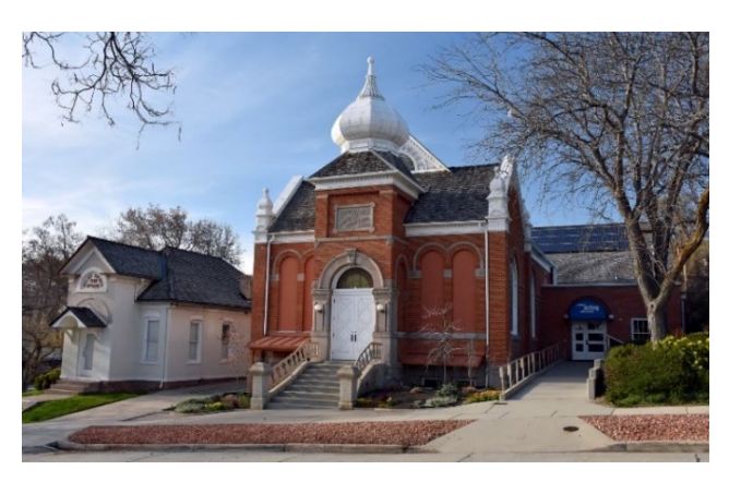
Photo above: After decades as a house of worship, the building at 168 W. 500 North has been home to Salt Lake Acting Company since 1982, housing two theaters, rehearsal space, dressing rooms, a box office and more.