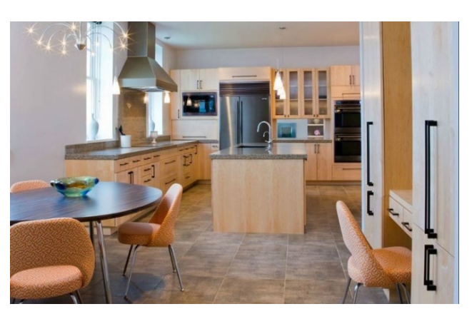
The Meridien Residences at Capitol Park involved restoring the old Salt Lake City VA Hospital into a 95,000-square-foot condominium structure overlooking the Salt Lake Valley. The exterior underwent an extensive facelift to restore its original look, and the interiors were seismically strengthened and renovated. A new 40,000-square-foot underground parking structure was constructed in the back and added a new wing for additional living space.