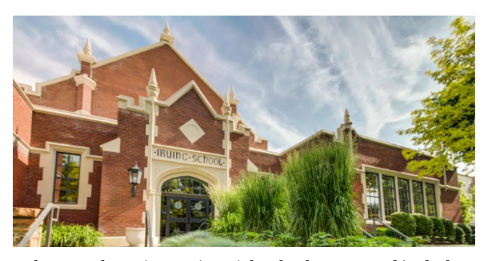
What was the Irving Junior High School constructed in the late 1920's, is now home to the Irving Schoolhouse Apartments and contains approximately 230 1- and 2-bedroom apartments.