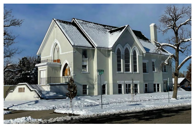
The building above at 1102 W 400 N, known as the 29<sup>th</sup> Ward Meeting House, recently went through the conditional use process for adaptive reuse of a landmark site in a residential district. Approval was granted for the building to be reused for a community center.

The proposed incentive in this section is primarily a use incentive to allow for flexibility of uses in eligible buildings. Buildings that would be eligible for this incentive are generally those that convey high artistic, historic or cultural values and large underutilized structures that are part of the neighborhood fabric. Often eligible buildings may have outlived their original use but are difficult to reuse without a rezone process due to the limited uses allowed in the zoning districts their former uses are generally located in, such as single family residential institutional.